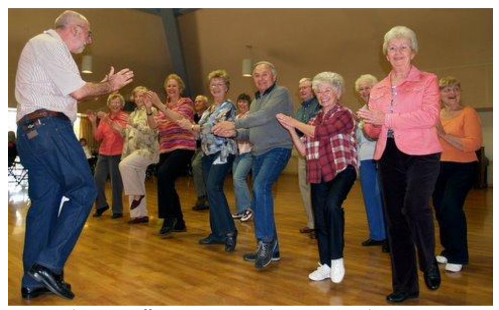
Line dancing is effective exercise and supports social engagement

Other planning considerations highlighted by those interviewed included the recognition of the "changing tastes" of seniors in recreation and physical activity programming. Several municipalities are providing "learn to" sessions for older adults to try new activities including the rental of needed physical activity equipment to sample new activities. Some interviewed also commented on the distinction and implications for planning when considering the needs of what some termed the 'young old' (55-70 yrs.) and the different desires and interest in programming this group has compared with 'the old, old' group (over 70 yrs.).